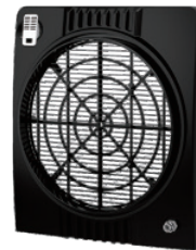
Return Duct Kit