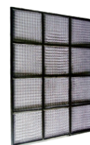
Clean Air Filter