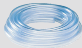
Wrinkle free tube